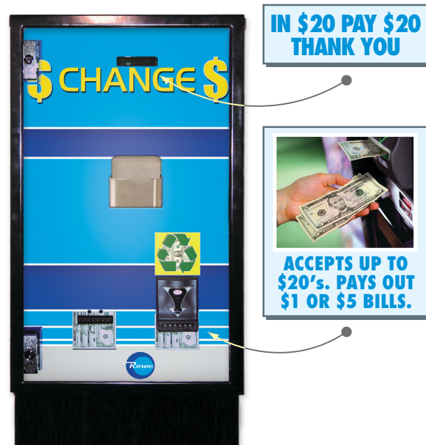
FRONT LOAD ON MOUNTING BASE